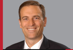
ADAM LAXALT R