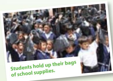
Students hold up their bags of school supplies.

was given learning games, teaching materials, books and more. Daystar also hosted a special outreach and dedication event for a new church that just completed construction in Puerto San Jose, Guatemala. During the first church service we were able to bless 180 people with food from Pollo Campero, a local restaurant which would usually only be a special treat for them. Every family was also given a large bag of nutrition essentials that will feed them for over a month.