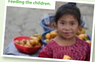
Feeding the children.

At a local Bible College, we were able to give each of the pastors in training their own Thompson Study Bible, as well as 50 hardcover red letter Bibles to new believers. These tools were given to ensure the people are equipped to grow in Christ and further the kingdom