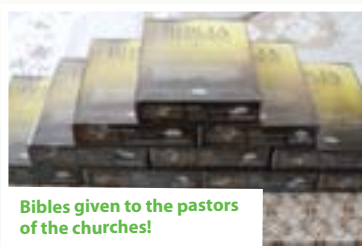
Bibles given to the pastors of the churches!

Together, Daystar and its partners are sowing seeds all over the world